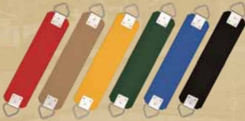
SWING SEATS #28413-M9

Ground Space: 23' x 4' (7m x 1.2m) Protective Area: 35' x 32' (10.7m x 9.8m) Shipping Weight: 360 lbs. (163 kg)