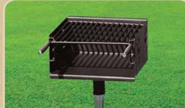
PARK GRILL #1104J $329