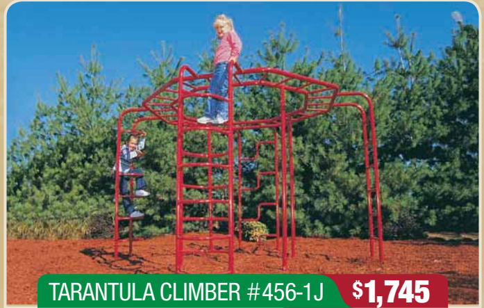
TARANTULA CLIMBER #456-1J $1,745