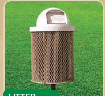
LITTER RECEPTACLE #1129J $612