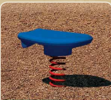
SURFER #946-1J $344