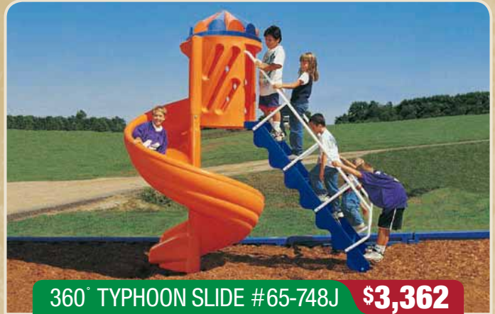
360° TYPHOON SLIDE #65-748J $3,362