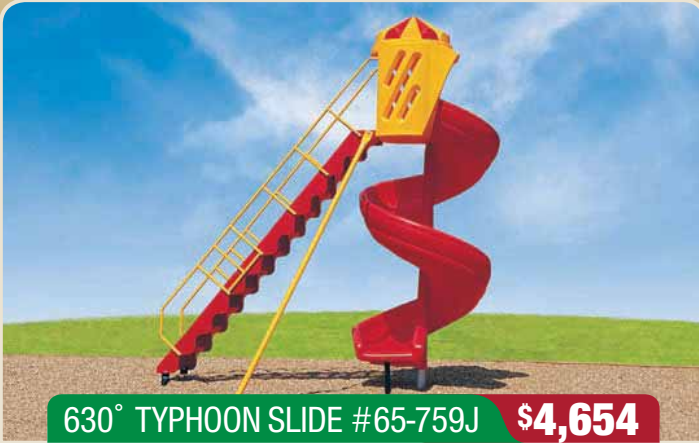
630° TYPHOON SLIDE #65-759J $4,654