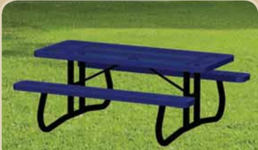
6' PICNIC TABLE #1116J $793

SWING SEATS BAKER'S DOZEN SALE Get 13 Belt Seats for the price of 12! $528