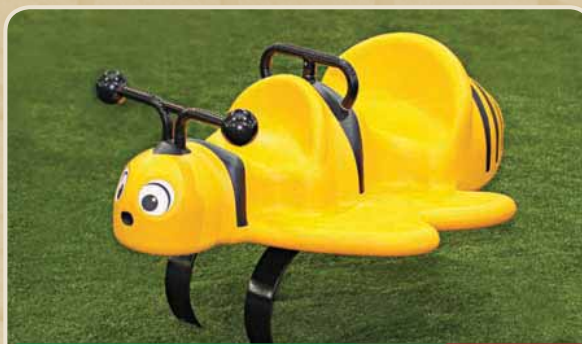
BUZZY BUMBLE BEE RIDER #961J $862