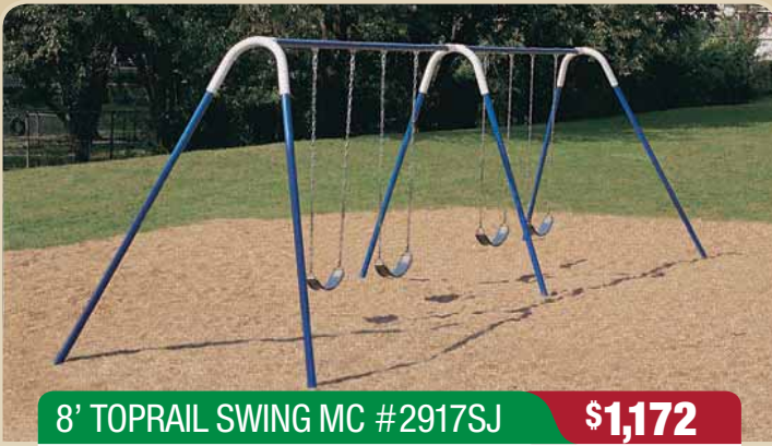
8' TOPRAIL SWING MC #2917SJ $1,172