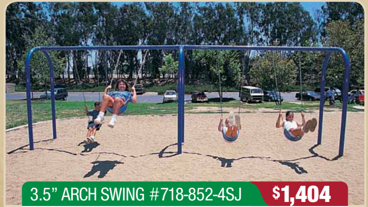
3.5" ARCH SWING #718-852-4SJ $1,404