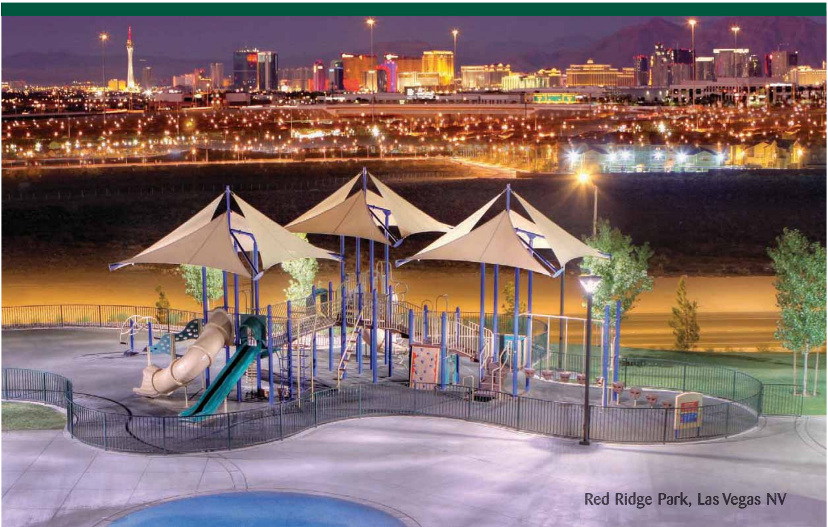
Red Ridge Park, Las Vegas NV