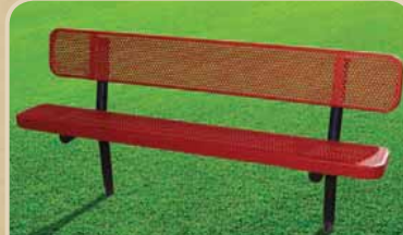
6' BENCH PERM #1266J $466