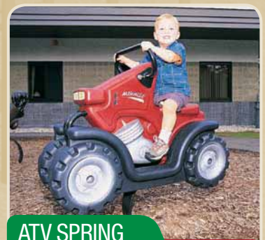
ATV SPRING RIDER #953J $820

Ground Space: 6' x 4' (1.8m x 1.2m) Protective Area: 18' x 17' (5.5m x 5.2m) Shipping Weight: 340 lbs. (154 kg)