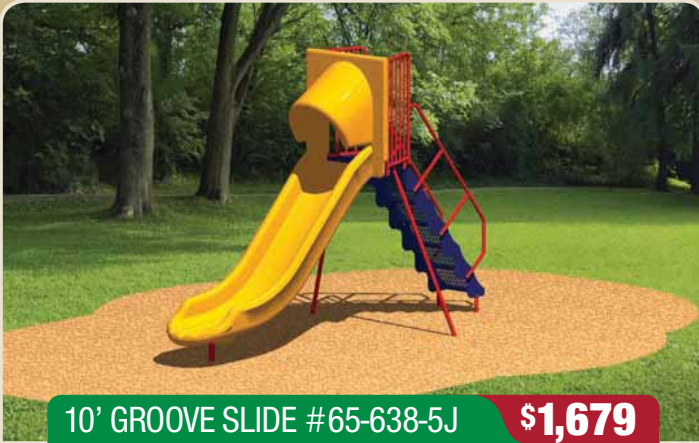
10' GROOVE SLIDE #65-638-5J $1,679